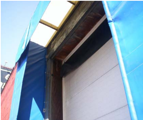
Rigid Head Frame, Foam Side Frames

The foam sides of the Perma Soft Sided Shelter are designed to lessen the chance of damage caused by off center trailers. Also where lift gates and other specialty trailer designs might be in use. The side curtains are easily removed in summer (to reduce wear) or to replace. Bottom draft pads close the gap at the bottom sides of the trailer. All in all, this is one of the most versatile and cost efficient shelters on the market today.