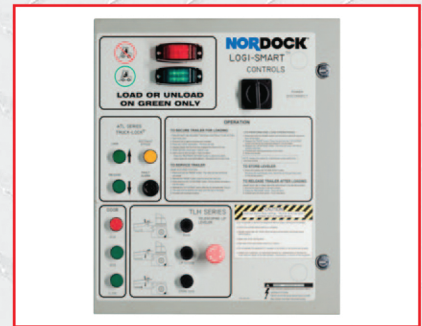
Optional LOGI-SMART™ Integrated Control Systems