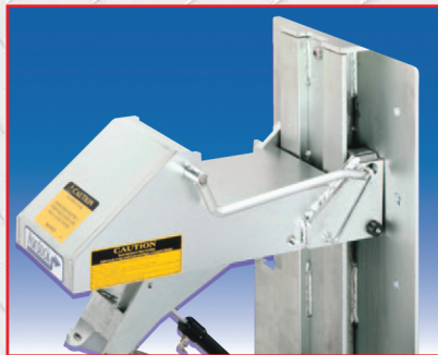
Available TRUCK-LOCK® Safety Systems