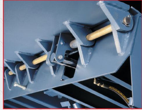
Exclusive Lip Lug & Header Plate Design

The front and rear hinge rods are SAE 1045 superior shaft, zinc plated and factory coated with anti-seize lubricant.