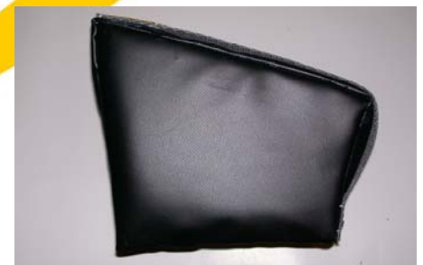
Sloped Face of the Side Pads

Optional Wear Pleats (shown) Make Dock Seals More Durable