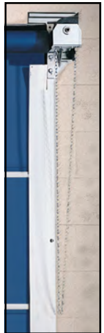
Manual Chain Hoist