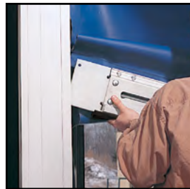
Easily resets, without the need for tools