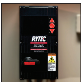
System 4 shown with optional rotary disconnect