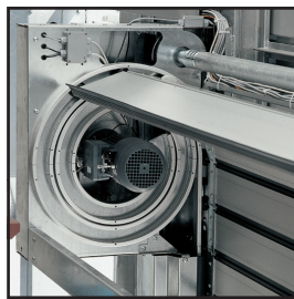
Compact AC Drive Motor