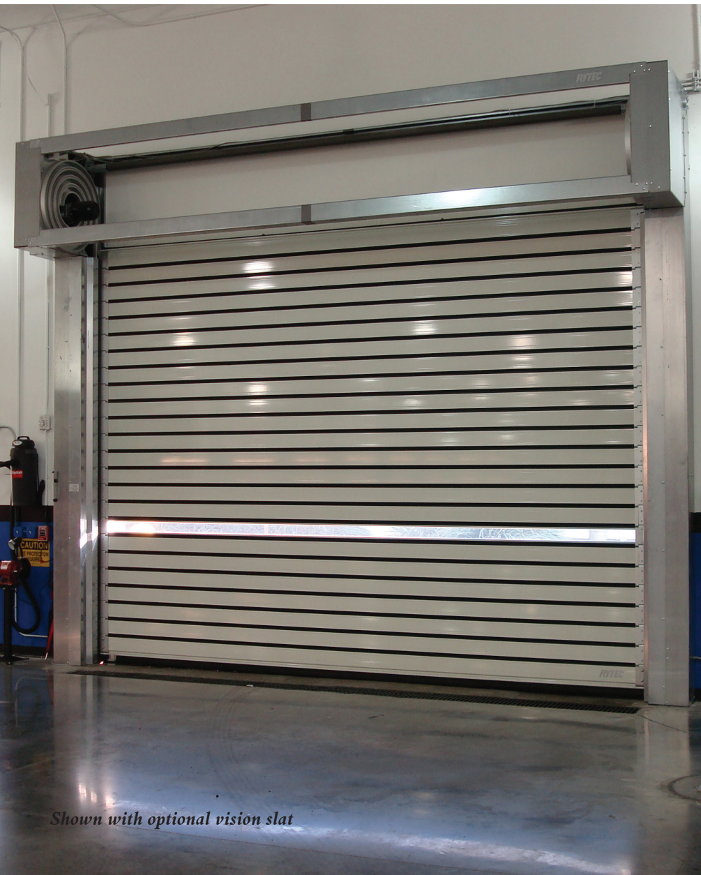
Shown with optional vision slat

Energy Efficient and Tight Seal - Aluminum slats, along with a durable rubber membrane which covers their aluminum connecting hinges, provide a 100% seal against dust pollution, drafts, and inclement weather. Optional insulation simply adds to the energy savings.