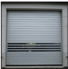
Shown with optional vision slats