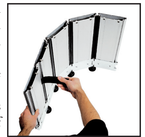
Integral rubber weatherseal