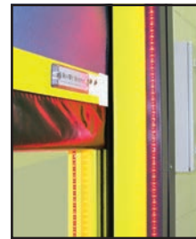
Pathwatch Safety Light System indicates door closing Turbo-Seal Insulated pictured above