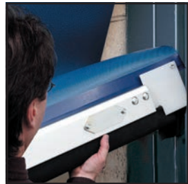
Break-Away tabs are easily reinserted into the side columns