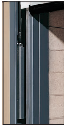
Counterweights within side column assist the motor in opening and closing the door