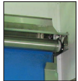
Hinged drip guard lifts up for easy cleaning